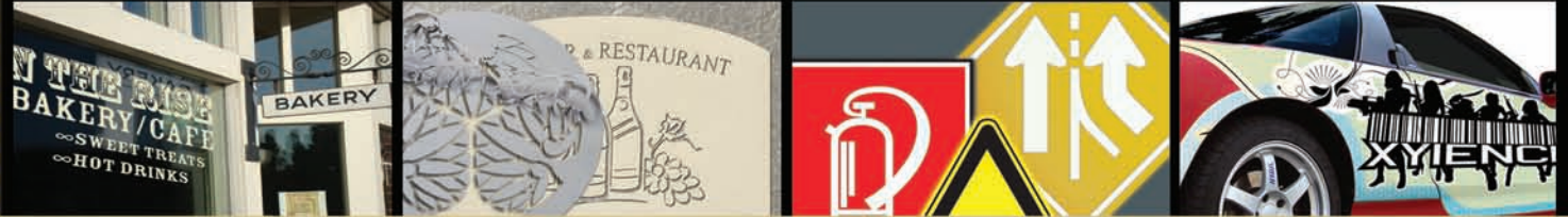
VINYL SIGNS & LETTERING, STONE & GLASS ETCHING, SANDBLAST RESIST MEDIA, TRAFFIC/TRANSPORTATION SIGNS, VEHICLE GRAPHICS