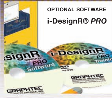
OPTIONAL SOFTWARE i-DesignR® PRO